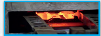
Axisymmetric compression - long product & forgings

Advanced high-performance tools for industrial & academic research into process simulation